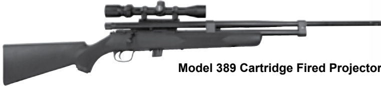
Model 389 Cartridge Fired Projector