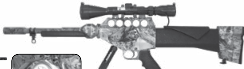
X-Caliber Gauged Co2 Rifle