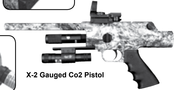
X-2 Gauged Co2 Pistol